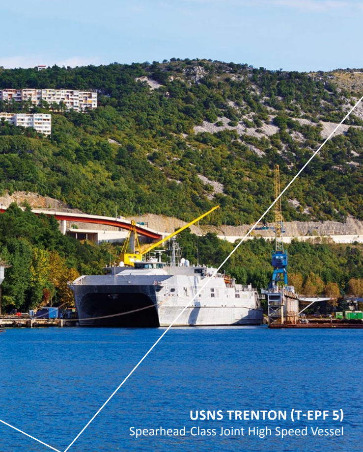
USNS TRENTON (T-EPF 5) Spearhead-Class Joint High Speed Vessel